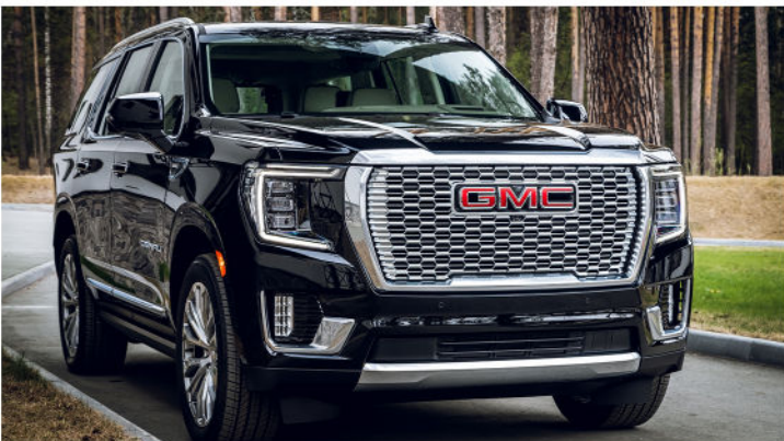
The vehicle shown is for illustrative purposes only. The actual luxury car may vary depending on the destination.

Experience the excitement of Formula 1 in Las Vegas, Nevada in ultimate luxury. Our private jet will whisk you away to the race track in comfort and style, where you'll enjoy VIP treatment throughout your stay. From spacious seats to exclusive access to the track, you'll have everything you need to make your F1 experience unforgettable.