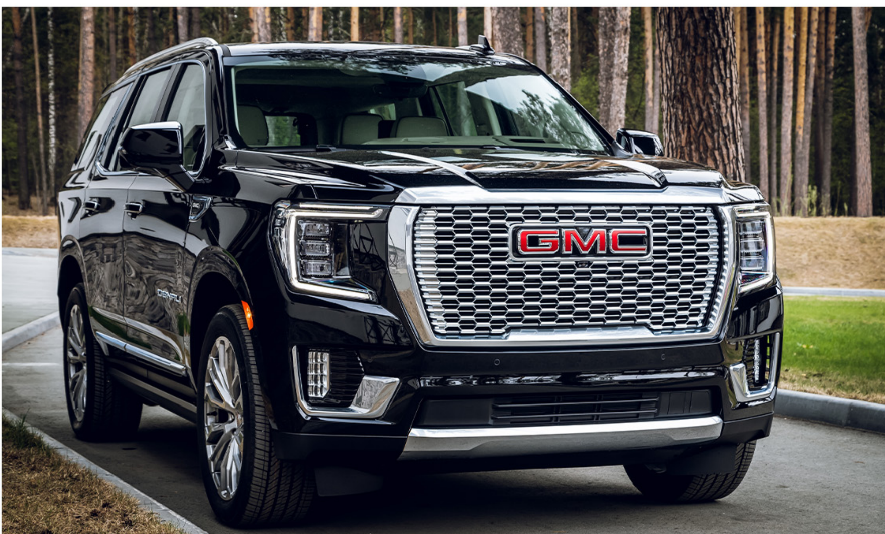
The vehicle shown is for illustrative purposes only. The actual luxury car may vary depending on the destination.

Embark on a private jet adventure from Miami to Melbourne for the Formula 1 Grand Prix (19 - 25 March), followed by a vibrant Sydney experience (25 - 30 March). Enjoy motorsport thrills and explore two dynamic Australian cities.