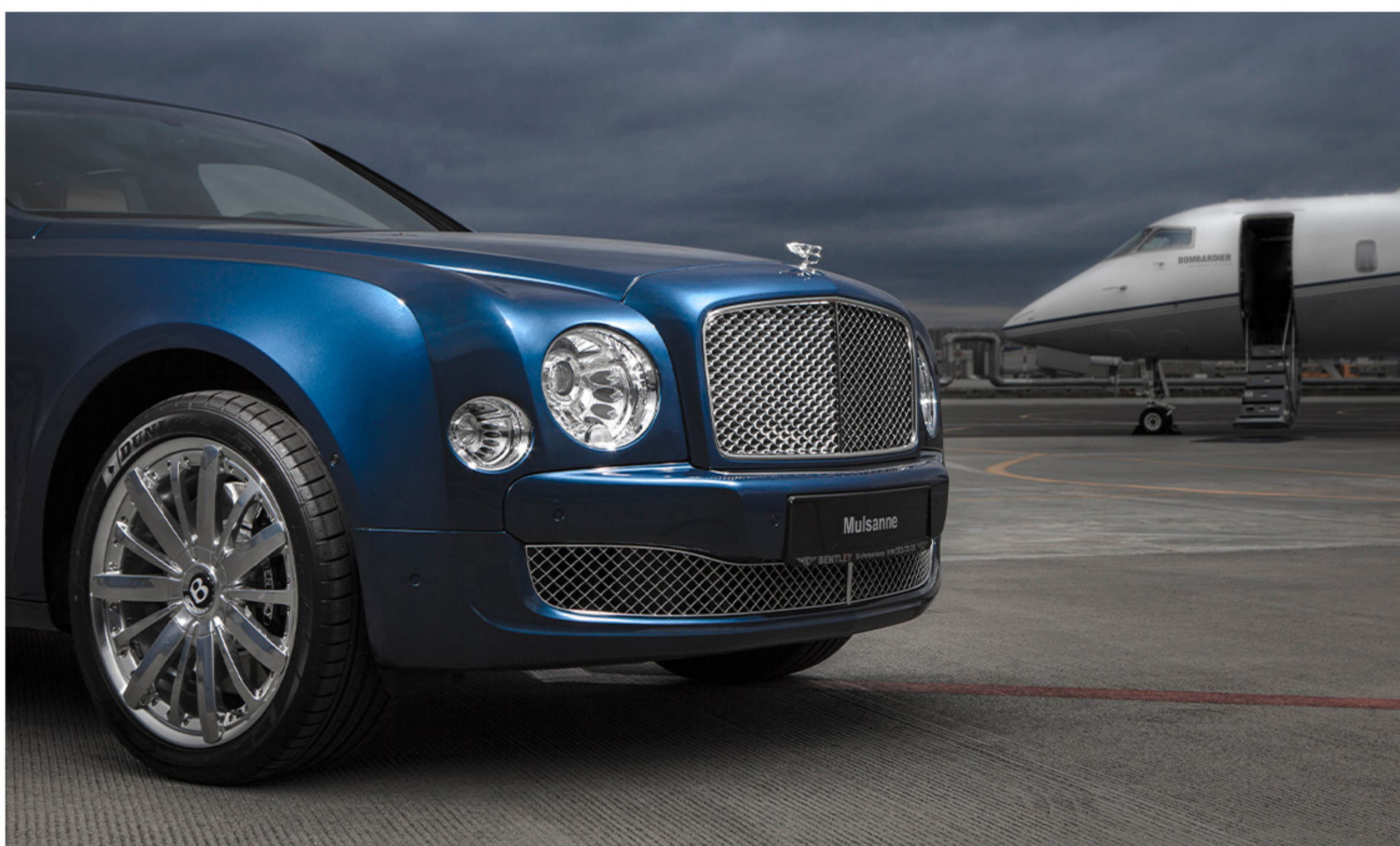
The vehicle shown is for illustrative purposes only. The actual luxury car may vary depending on the destination.

Embark on a private jet adventure from Los Angeles to Singapore for the Formula 1 Grand Prix (18th - 23rd September), followed by a vibrant Bali experience (23rd - 28th September). Enjoy motorsport thrills and explore two dynamic cities.