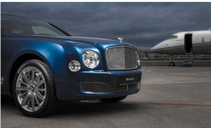
The vehicle shown is for illustrative purposes only. The actual luxury car may vary depending on the destination.

Experience the excitement of Formula 1 in Sakhir, Bahrain, in ultimate luxury. Our private jet will whisk you away to the race track in comfort and style, where you'll enjoy VIP treatment throughout your stay. From spacious seats to exclusive access to the track, you'll have everything you need to make your F1 experience unforgettable.