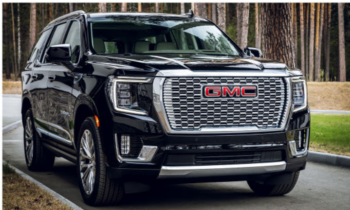
The vehicle shown is for illustrative purposes only. The actual luxury car may vary depending on the destination.

Embark on a private jet adventure from Madrid to Shanghai for the Formula 1 Grand Prix (April 16 - 22), followed by a vibrant Beijing experience (April 22 - 27). Enjoy motorsport thrills and explore two dynamic Chinese cities.