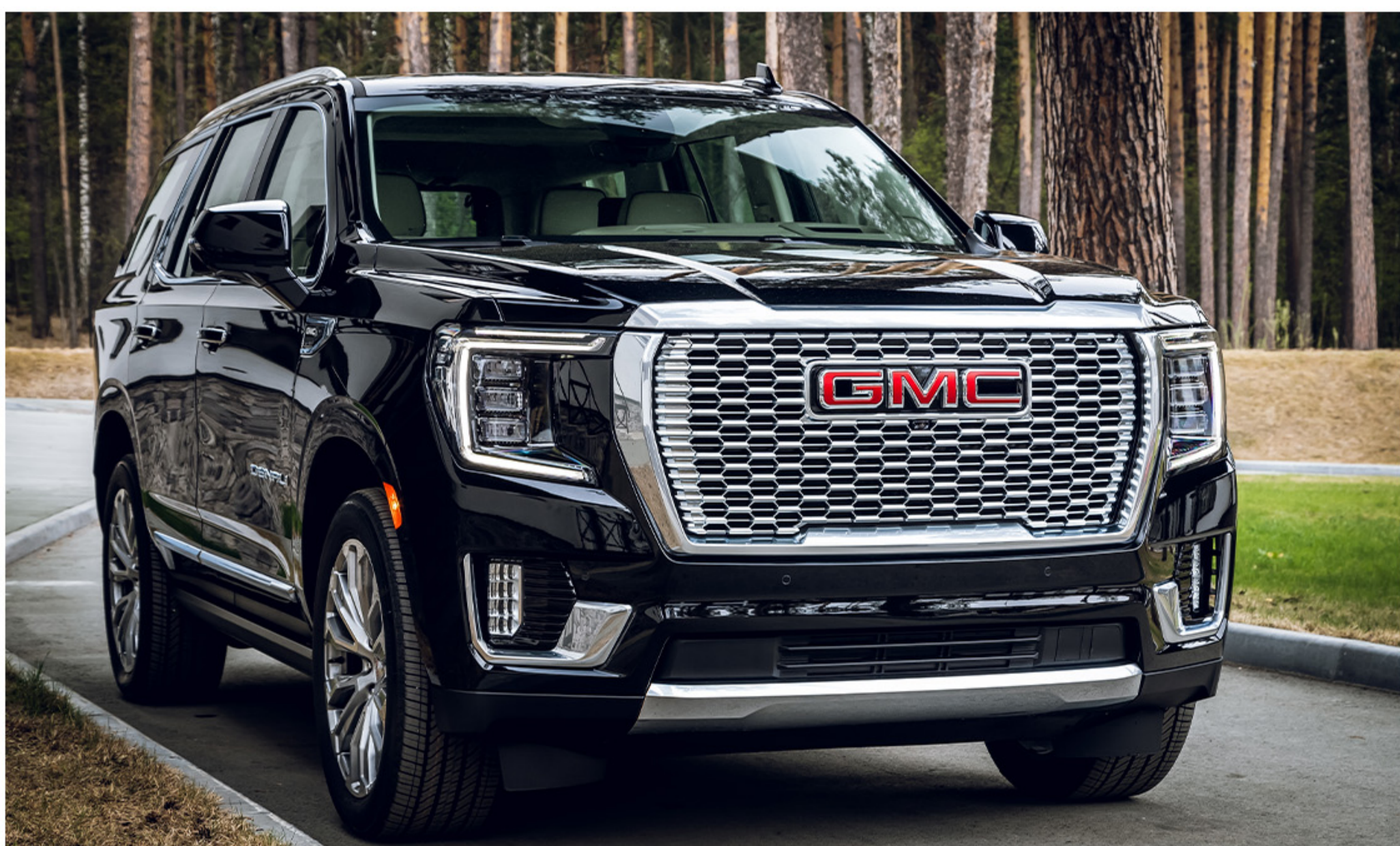
The vehicle shown is for illustrative purposes only. The actual luxury car may vary depending on the destination.

Embark on a private jet adventure from Madrid to Singapore for the Formula 1 Grand Prix (September - 18 23), followed by a vibrant Bali experience (September - 23 28). Enjoy motorsport thrills and explore two dynamic cities.