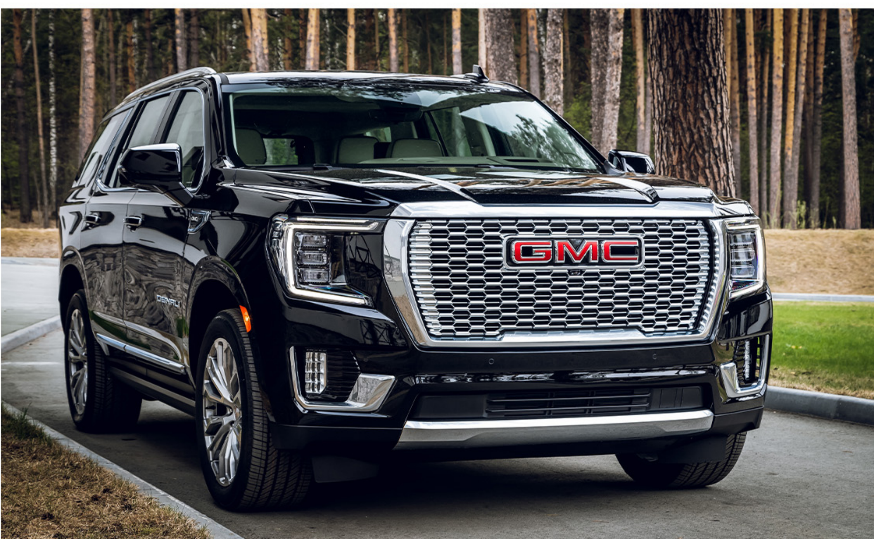
The vehicle shown is for illustrative purposes only. The actual luxury car may vary depending on the destination.

Embark on Formula 1 luxury in Monaco, with our exclusive package, which includes helicopter transfers to and from Nice Airport. Enjoy unmatched comfort on our private jet. Anticipate the racing thrill with plush seats and exclusive track access. They are curated for an unforgettable Monaco Grand Prix experience, where every moment embodies extraordinary luxury.