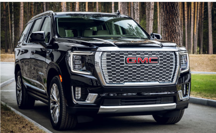
The vehicle shown is for illustrative purposes only. The actual luxury car may vary depending on the destination.

Embark on a private jet adventure from New York to Abu Dhabi for the Formula 1 Grand Prix (4th - 9th December), followed by a vibrant Dubai experience (9th - 14th December). Enjoy motorsport thrills and explore two dynamic Middle Eastern cities.