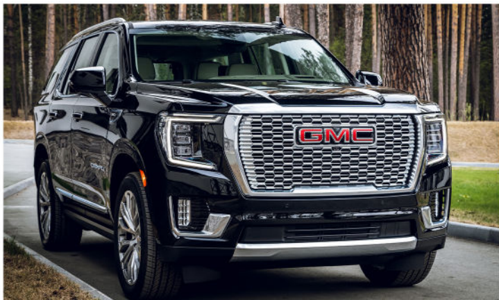
The vehicle shown is for illustrative purposes only. The actual luxury car may vary depending on the destination.

Experience the excitement of Formula 1 in Baku, Azerbaijan, in ultimate luxury. Our private jet will whisk you away to the race track in comfort and style, where you'll enjoy VIP treatment throughout your stay. From spacious seats to exclusive access to the track, you'll have everything you need to make your F1 experience unforgettable.