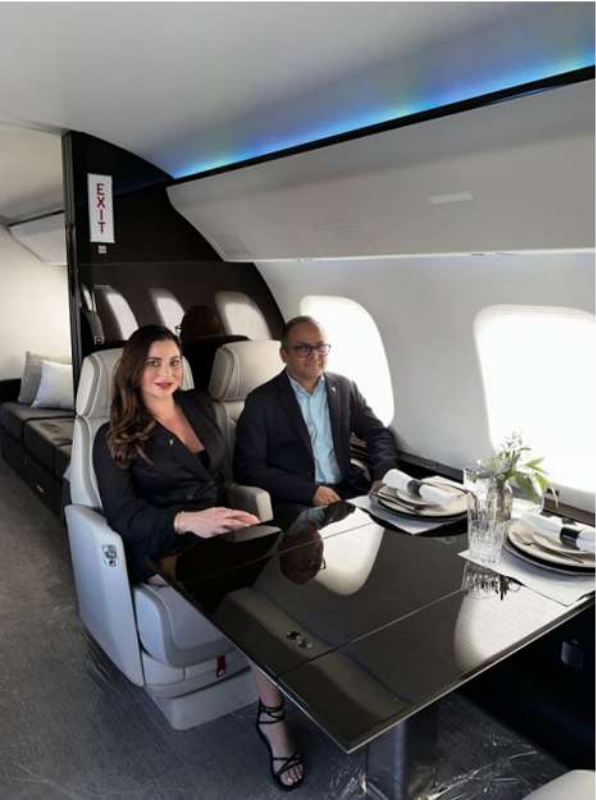
* Bombardier service center at Opa-Locka