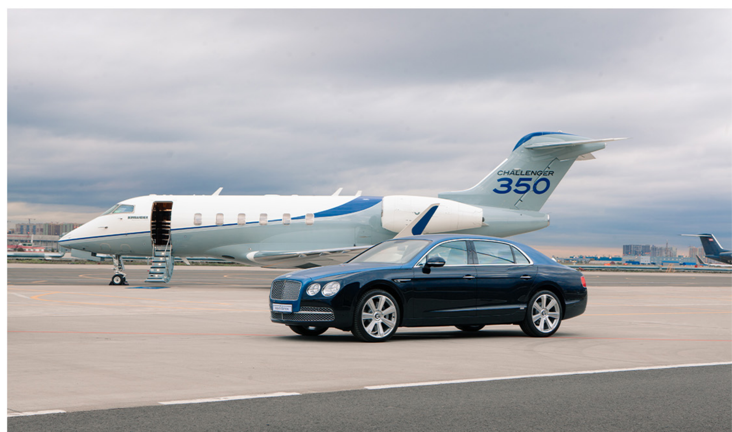
The vehicle shown is for illustrative purposes only. The actual luxury car may vary depending on the destination.