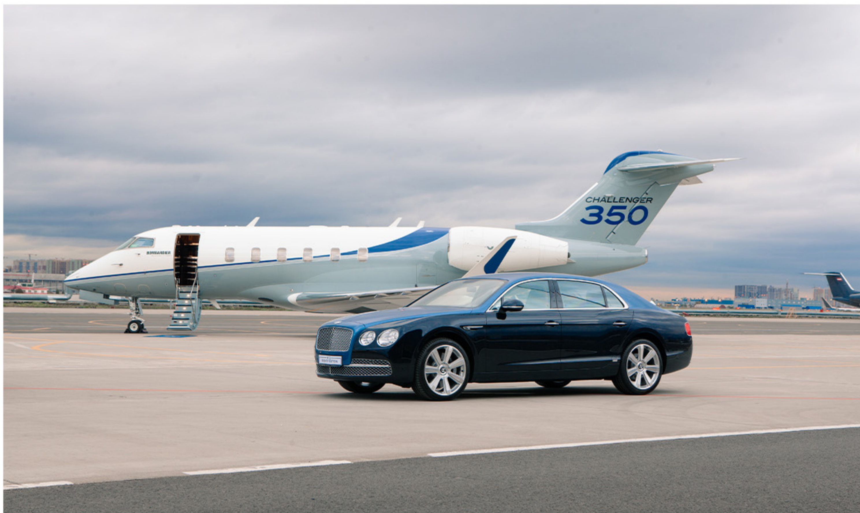
The vehicle shown is for illustrative purposes only. The actual luxury car may vary depending on the destination.