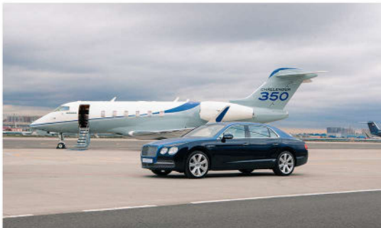
The vehicle shown is for illustrative purposes only. The actual luxury car may vary depending on the destination.