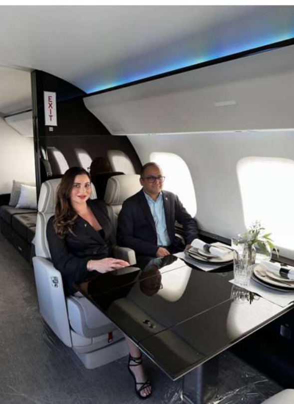
* Bombardier service center at Opa-Locka